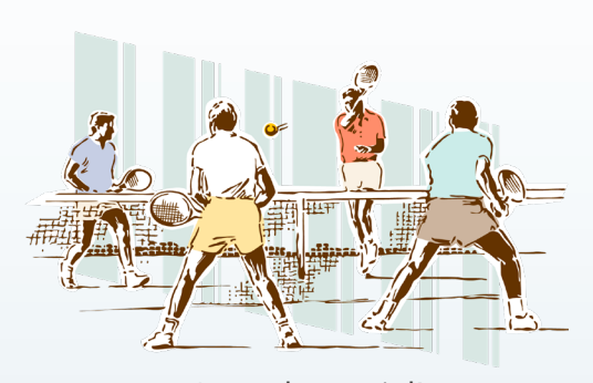
Come be social!